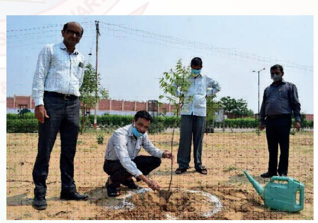
Faculty of the university carrying out plantation in campus

department will also develop an "Oxy-Van" in an area of 5 acres in the university which will not only boost the aesthetic beauty of campus but also provide shelter to native birds. Students were encouraged to plant the trees in their locality during the lockdown period.