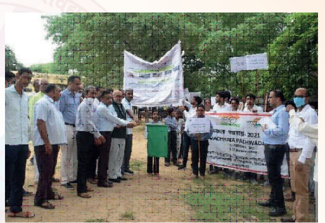
Hon'ble VC planting the tree in Govt School of Jant Village and flagging off the Swachhata rally